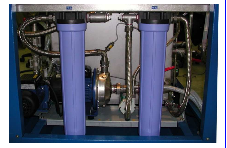
- Patented Filtration System -